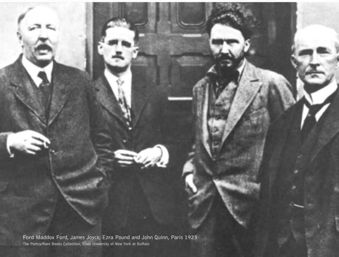
Ford Maddox Ford, James Joyce, Ezra Pound and John Quinn, Paris 1923

In the summer of 1920, the Joyce family moved from Trieste to Paris. They originally originally thought they would only be staying there for a few weeks but, encouraged by the American poet and editor Ezra Pound, ended up staying for twenty years. Paris was an ideal place for him to work - there was a vibrant artistic community, many friends and supporters, and fairly inexpensive rents. Joyce's writing became even more experimental and daring there; he wrote the last four chapters of Ulysses in Paris and all of Finnegans Wake . By the time Ulysses was published there in 1922, he was already a considerable literary celebrity. Joyce left Paris at the beginning of the Second World War in 1940, much as he had fled Trieste 25 years before.