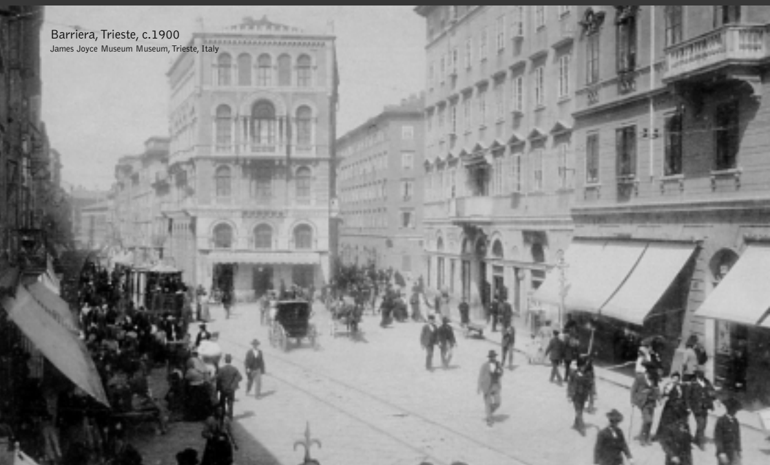
Barriera, Trieste, c.1900