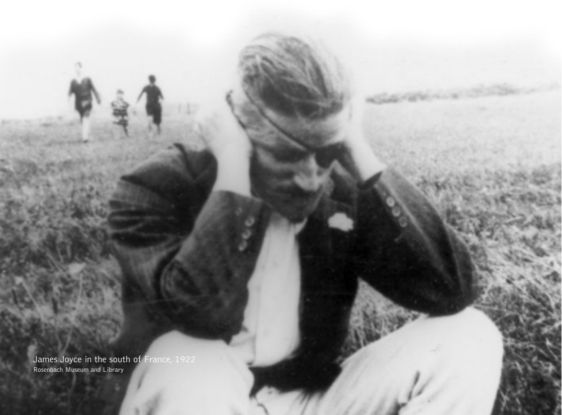
James Joyce in the south of France, 1922

In order to understand fully Joyce's achievement, it is important to understand his poor eyesight. In his autobiographical novel A Portrait of the Artist as a Young Man , the character Stephen Dedalus is unfairly punished for not doing his schoolwork even though his glasses had been broken and he could not see - an episode that happened to Joyce himself. From 1917 to 1930 he had at least 25 different operations on his eyes and often could not work. He would occasionally ask friends to take dictation if he needed to meet a deadline. Because of this it took him longer to complete his books, which are often richer in descriptions of sounds and smells than of sights.