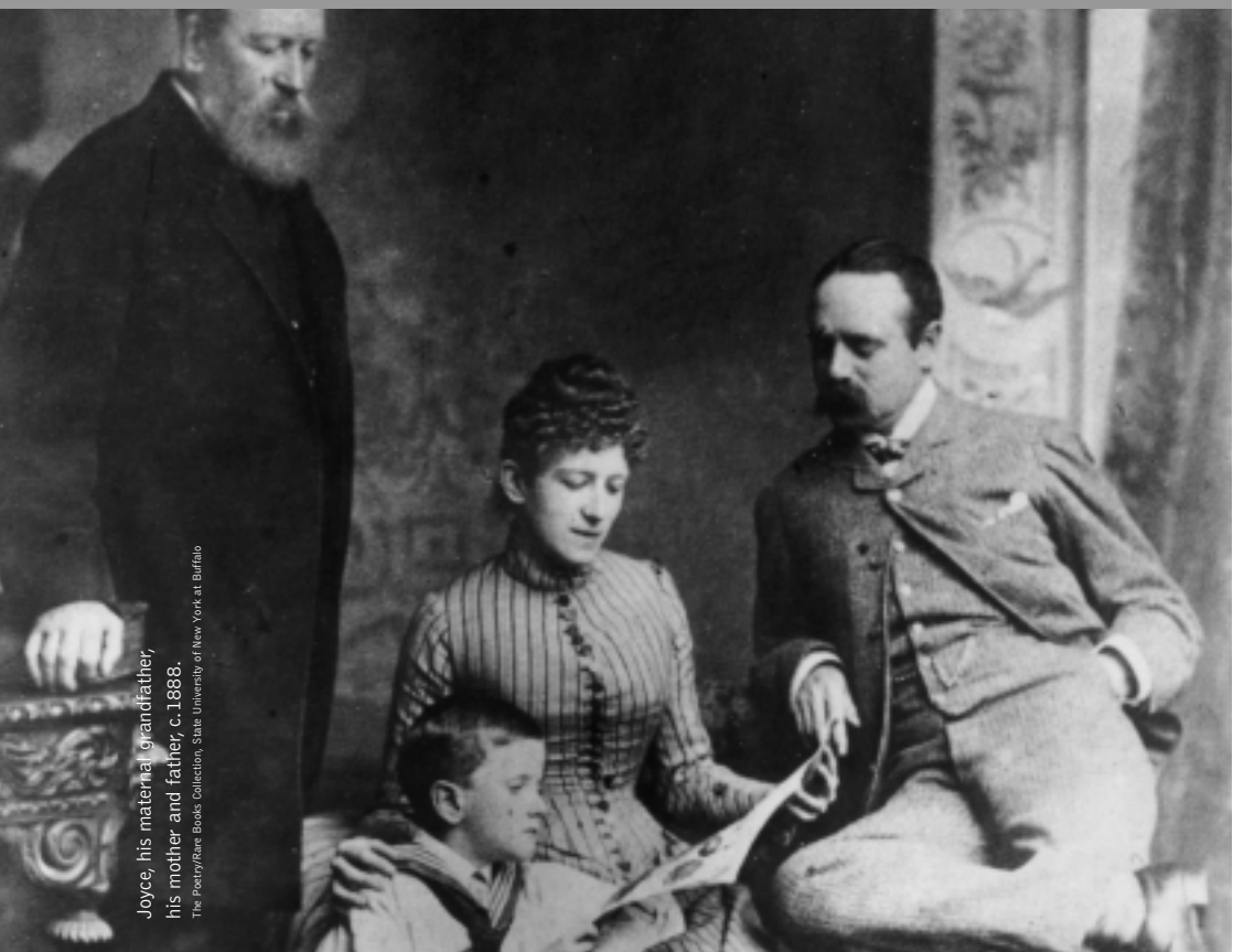
Joyce, his maternal grandfather, his mother and father, c.1888.